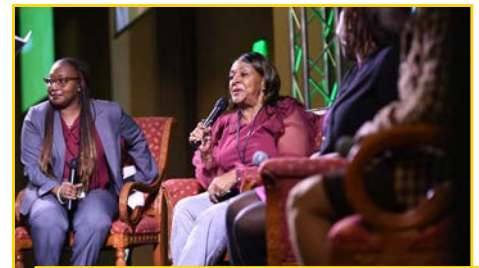
Institute 2021 in Muscle Shoals, AL

The meeting will culminate on Tuesday, Aug. 30, with a town hall to address health equity and